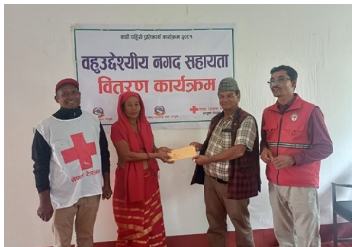
Multipurpose cash support to flood affected beneficiary in Sindhuli

Panchthar, Syangja, and Kanchanpur districts. Each household received NPR 15,000 (fifteen thousand). Furthermore, NPR 15,000 (fifteen thousand) was distributed to 326 individuals, including the elderly, persons with disabilities, and pregnant and lactating women as per Protection, Gender, and Inclusion (PGI) perspective. Most of the cash was provided through beneficiaries' personal bank accounts and cash-in-hand in some cases also. Details of the cash support provided in various districts are presented in Table 1.