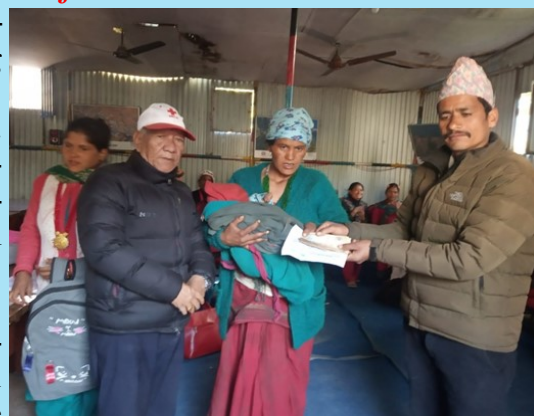
Cash support to lactating woman in Jajarkot

NRCS provided unconditional multi-purpose cash to 970 (Jajarkot-540 and Rukum West-430) marginalized pregnant and lactating women in earthquake affected Jajarkot and Rukum West districts. The provided cash was NPR 8,000 (eight thousand) per beneficiary. The cash was provided through the beneficiaries' personal bank accounts and IME. Similarly, in Kavre 171 flood and landslides affected, marginalized pregnant and lactating women have received NPR 12,000 (twelve thousand) based on severity and identified needs. The cash was supported via beneficiaries' personal bank accounts and cash-in-hand modalities. NRCS coordinated with the local government and health unit to identify and select beneficiaries for cash support. In total, NPR 9,812,000 (nine million eight hundred twelve thousand) was supported to these women in three districts through the partnership of United Nation Population Fund (UNFPA).