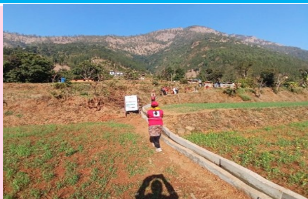
A newly constructed water canal by applying cash-for-work modality in Rukum West

A 6.4 magnitude earthquake struck Jajarkot district on 3 November 2023 at 11:47 local time. The epicenter was located in Ramidanda in Jajarkot district, which claimed the lives of 154 people in Jajarkot (101), and Rukum West (53) district and injuring 366 people. As of December 2024, no major aftershocks have been recorded however, the impact remained quite challenging as more than 75,000 houses were affected by the earthquake in 10 districts out of which Jajarkot, Rukum West and Salyan districts were badly affected. Up to April 2024, NRCS supported response related activities including transitional shelter and toilet construction.