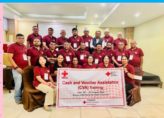
Group photo of CVA Training

The main strategy of the training was to promote the knowledge and skills of the participants through both theoretical and practical exercises, which were integral components of each session. The training course was designed and developed based on the IFRC standardized module by incorporating local context. Practical knowledge and skills were delivered through case studies to broaden participants' understanding on CVA. The trainings were conducted with participatory approaches including group discussions, demonstrations, question and answer sessions, practical exercises, brainstorming, and simulations.