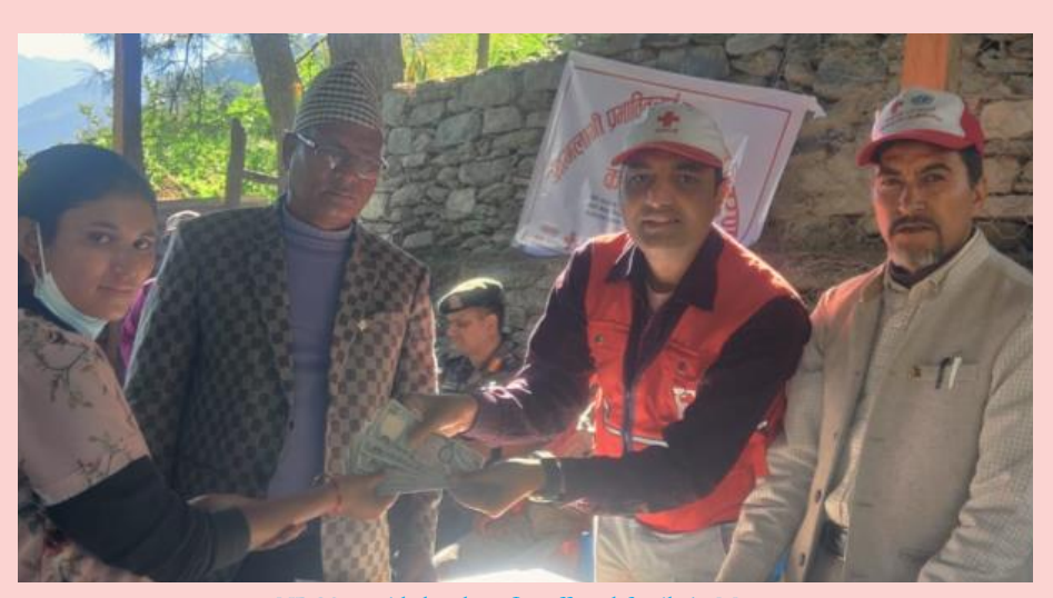
NRCS provided cash to fire affected family in Mugu

The local market at Gamgadi, the headquarters of Mugu district, was functional. NRCS, in financial support of DRC, provided unconditional multi-purpose cash grant NPR 15,000 (fifteen thousand only) to each of these 33 fire affected families in October. In total NPR 495, 000 (four hundred ninety five thousand only) cash was supported to the affected families. All the cash was provided through cash in hand. NRCS also provided