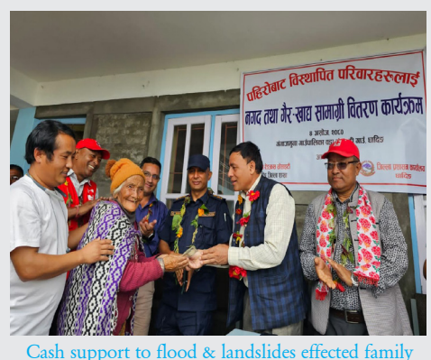
ash support to flood & landslides effected family in Dhading

After heavy rainfall in August, 53 households were affected by flood and landslides in Ward No. 1 of Ganga Jamuna Rural Municipality in Dhading district. NRCS assessed the situation and found the local market Ganga Jamuna Rural Municipality functional. Thus, responding to the affected families, NRCS with the financial support of DRC provided unconditional multi-purpose cash grant NPR 15,000 (fifteen thousand only) per family to 53 flood and landslides affected families. In total NPR 795,000 (seven hundred ninety five thousand only) cash was supported to the affected families. All the cash was provided through cash in hand.