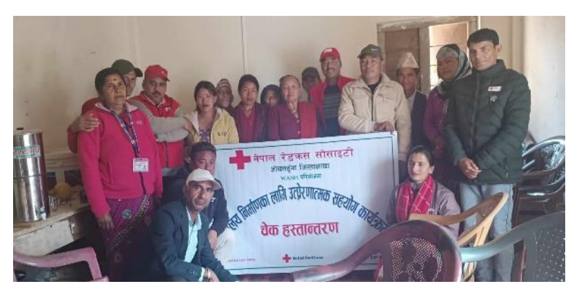
Cheque handover at Molung Rural Municipality Ward No. 3, Okhaldhunga

NRCS has been implementing Sustainable and Inclusive WASH Project in Sindhuli, Okhaldhunga and Ramechhap districts with financial support of the IFRC and the British Red Cross. Under this programme, conditional cash grant NPR 5,000 (five thousand only) was provided to each of 40 vulnerable households of Okhaldhunga to improve their toilets. In total NPR 200, 000 (two hundred thousand only) cash was supported to the affected families. The beneficiaries were provided cash support in cheque as per the objective setup.