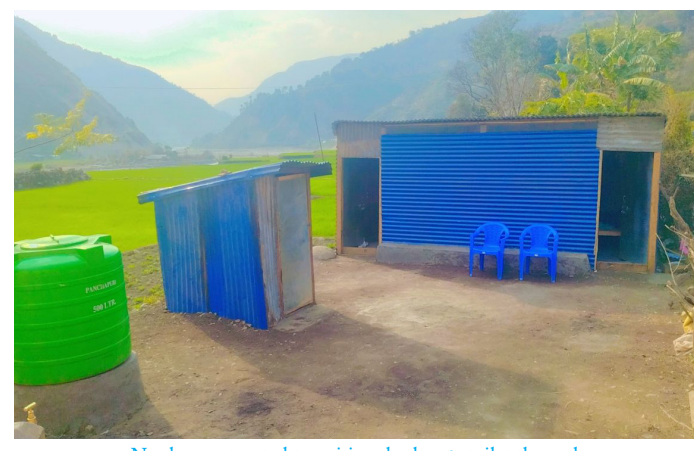
Newly constructed transitional selter & toilet through CVA modality in Bajhang district

NRCS supported first installment cash NPR 25,000 (twenty five thousand only) to each household to construct 250 transitional shelters, NPR 15,000 (fifteen thousand only)