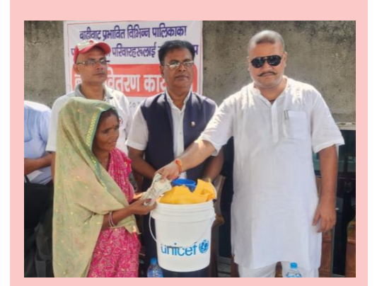
NRCS provided cash to flood affected family in Rautahat

25 houses were affected in Durgabhagawati Rural Municipality, Rajdevi Municipality, Rajpur Municipality, Fatuha Bijayapur Municipality and Gaur Municipality in August 2023 in Rautahat district. Detail assessment findings showed that the local markets in Rautahat district were functional. NRCS, in financial support of DRC, provided unconditional multi-purpose cash grant NPR 15,000 (fifteen thousand only) per family to 25 flood affected families in the above mentioned municipalities. In total NPR 375, 000 (three hundred seventy five thousand only) cash was supported to the affected families. The support was provided through cash in hand.