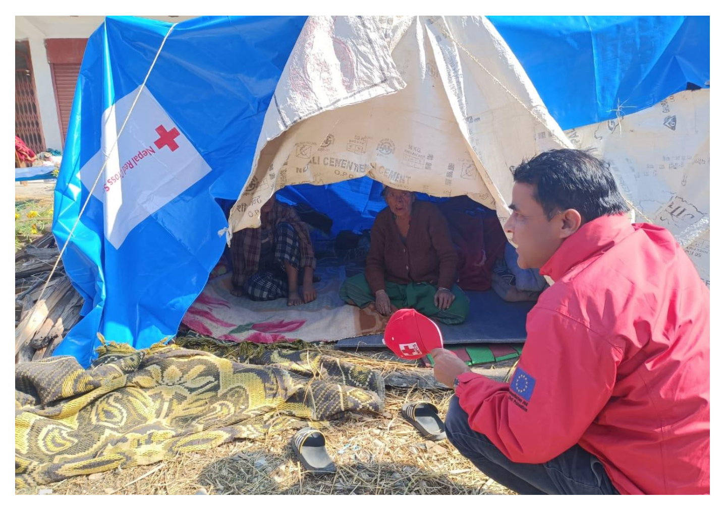
The Nepal Red Cross Society is on the ground providing emergency relief items to affected families.