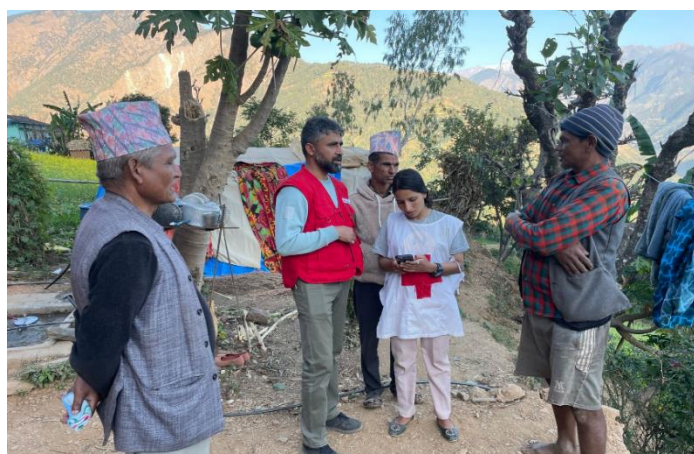
NRCS volunteer conducting detail assessment using Kobo tools in Nalgadh jointly monitored by Ward Chairperson, Jajarkot subchapter and technical team from NRCS HQs

A total of 193 volunteers (130 from Jajarkot and 63 from Rukum West) were orientated and are mobilized to conduct the detail assessment at Jajarkot (Bheri, Chedagad and Nalgad Municipality and Junichhande, Shivalaya, Kuse and Barekot Rural Municipality) and at Triveni and Sanobheri Rural Municipality of Rukum West. So far, 1,588 HHs from Jajarkot and 282 HHs data from Rukum West has been collected.