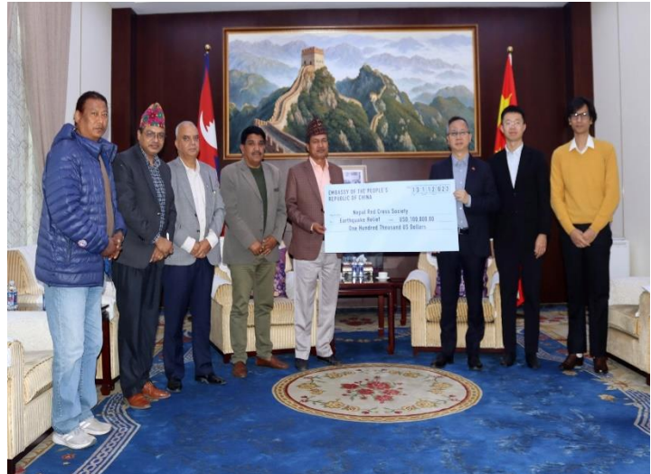
NRCS received one hundred thousand US Dollar from Embassy of the People's Republic of China to support EQ affected families.