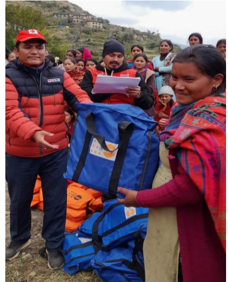
NRCS distributed dignity kit to women affected by earthquake.

In total, 337 staff and volunteers from HQs, district chapters and sub-chapters are mobilized in search and rescue, coordination, data collection including the detail assessment and relief distribution in the affected areas. The trained volunteers for PSS are mobilized and about 305 people received PSS service. Similarly, Central and Districts' NRCS blood transfusion service centers are also in standby position and NRCS is prepared for emergency blood transfusion.