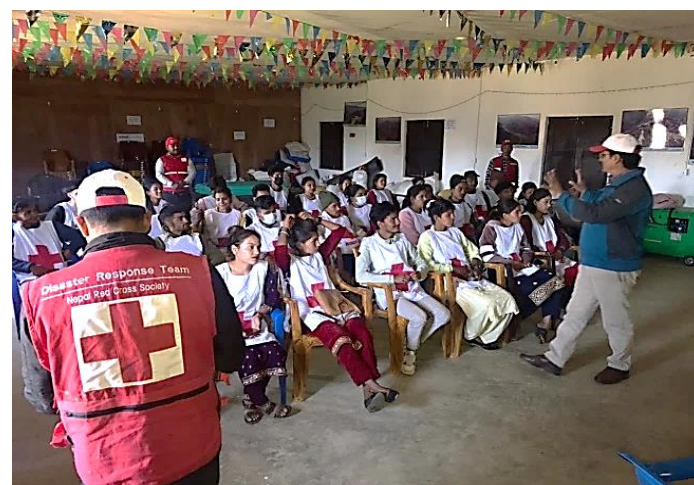
Orientation to the volunteers on detail assessment using Kobo prior to their mobilization in field at Triveni Rural Municipality, Rukum West