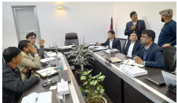
NRCS team with NDRRMA sharing about Red Cross engagement on transitional shelter and updates on the ongoing detail assessment in Jajarkot and Rukum West

NRCS Emergency Operation Centre (EOC) is coordinating, and participating in the meeting conducted by Ministry of Home Affairs (MOHA), National Disaster Risk Reduction Management Authority (NDRRMA), National Emergency Operation Centre (NEOC), District Emergency Operation Centre (DEOC), District Disaster Management Committee (DDMC), National Clusters. Similarly, NRCS organizes and coordinate with provincial and local government, movement and non-movement partners, NRCS sub national levels for the immediate response.