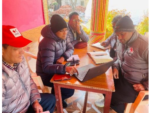
NRCS team briefing and validating detail assessment questionnaire in coordination with CDO of Jajarkot