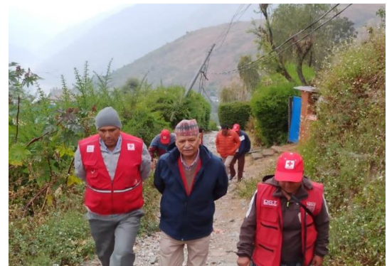
NRCS management team during field visit in the earthquake affected district to strengthen the coordination with government at all level

Also, NRCS Hotline 1130 is providing information and addressing compliances and grievances.