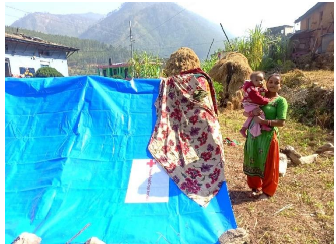
Families with young children living in tarpaulin provided by NRCS

The devastating earthquake in western part of Nepal on 3 November 2023 resulted in severe losses and damages of people and infrastructures. Aftermath of the disaster, though the communities are striving to regain normalcy the situation remains critical in terms of overall impact. Amid the growing winter cold, thousands of people including many new mothers, lactating women, elderly and children have been forced to take shelter under the tarpaulin. Informal reports show that at least 13 people including a one-month old baby from the Bheri Municipality of Jajarkot, have lost their lives from the cold related complications. There is high potential that the people specially children, pregnant women, new mothers, senior citizen or people with chronic diseases living under the tarpaulin or in open might develop respiratory illness and subsequent complications. In addition, the houses along with the sanitation facilities were destroyed, there is increasing risk of contamination of water sources and other vector borne diseases among the affected population.