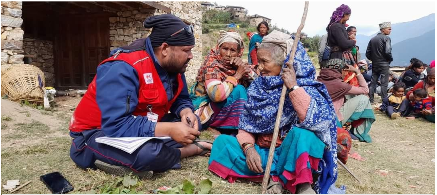
NRCS volunteer interacting with the senior citizen for extending the humanitarian assistance