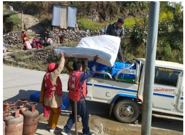
NRCS volunteer transporting the relief materials to the affected families in Rukum West