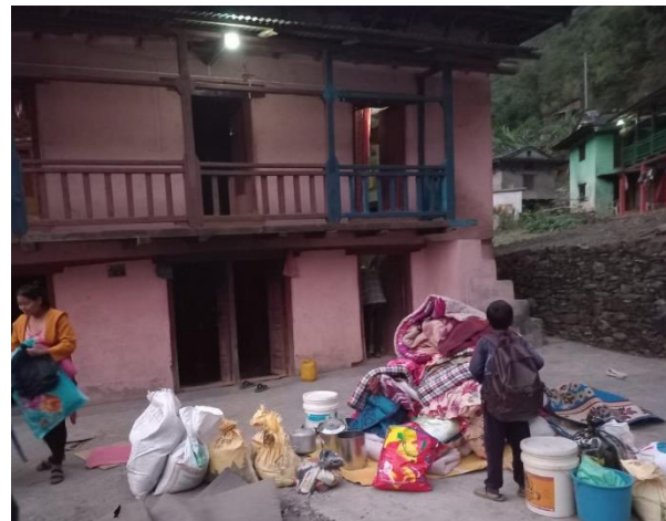
Families of partially destroyed houses are forced to leave outside due to fear of continuous aftershocks in Jajarkot district.

Local Government has followed one-door mechanism for relief material distribution and is being distributed based on the requirement of affected people. According to the NRCS Situation report shared by NRCS EOC, there is a death of 153 people and 365 people are injured. Altogether 61,298 families are affected, 21,404 families are displaced and 52,363 houses (17,824 fully/34,539 partially) are destroyed in nine districts 1 .