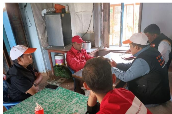
NRCS team coordinating with UNFPA team for distribution further planning for earthquake response in Rukum West.

NRCS Emergency Operation Centre (EOC) is coordinating, organizing and participating in the meeting conducted by Ministry of Home Affairs (MOHA), National Disaster Risk Reduction Management Authority (NDRRMA), National Emergency Operation Centre (NEOC), District Emergency Operation Centre (DEOC), District Disaster Management Committee (DDMC), National Clusters, provincial and local government, movement, non-movement partners, NRCS sub national levels for the immediate response.