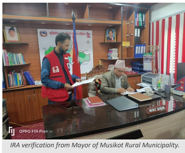
IRA verification from Mayor of Musikot Rural Municipality.