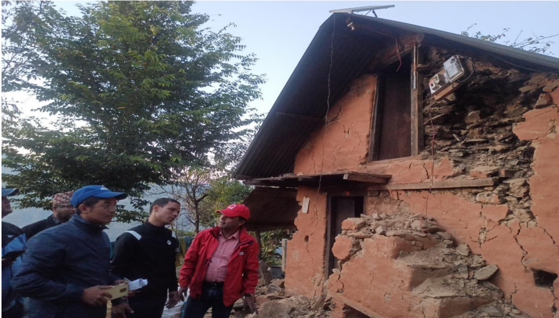
NRCS team observing and understanding the situation of earthquake affected people in Rukum West.

NRCS EOC planned ERT deployment in two rounds. The first round deployed members who are already in field are supporting in IRA, relief management and initial planning of detail assessment. And the second round deployed members will orient the field volunteers on Kobo application and those volunteers will be deployed for detail assessment in selected areas. Then after, the data collection, analysis and report will be produced. Business Continuity Plan (BCP) prepared and shared in team for regular response actions during Tihar holidays.