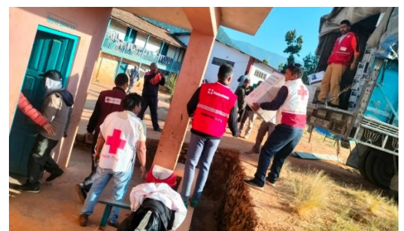
Relief materials unloading in Jajarkot district.