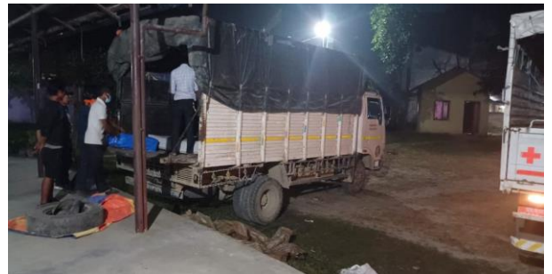
Nepalgunj warehouse team is loading relief materials for dispatching to most affected districts.

The trained volunteers for PSS are mobilized and about 305 people received PPS service. Similarly, Central and Districts' NRCS blood transfusion service centers are also in standby position and NRCS is prepared for emergency blood transfusion.