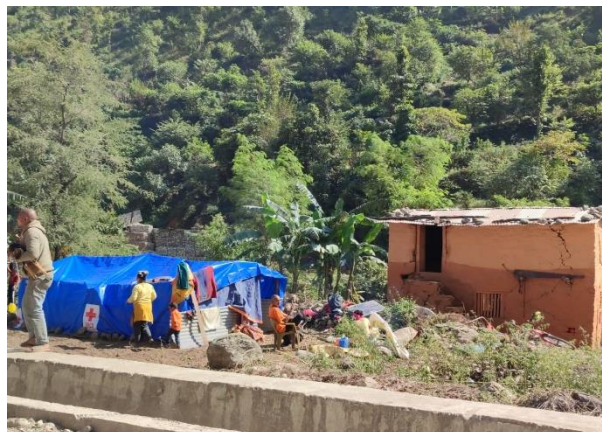
Affected families are residing under tarpaulin supported by NRCS in Aathbiskot Municipality, ward no. 14