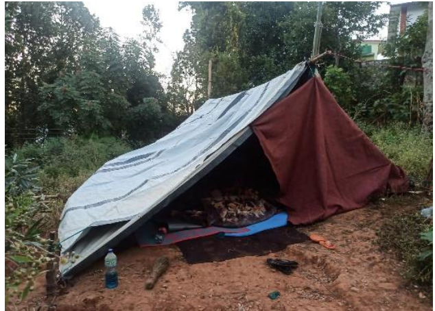
Use of tarpaulin supported by NRCS for temporary shelter.