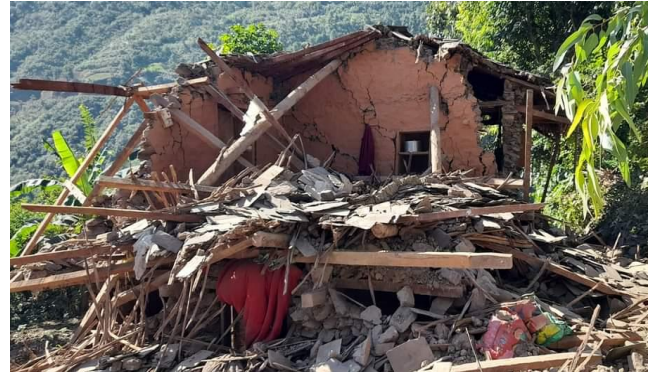
A house destroyed in Nalgadh Municipality, Jajarkot district

A magnitude of 6.4 earthquake hit western part of Nepal on 3 November 2023 at mid night 11:47 pm. The epicenter of the earthquake was at Ramidanda, Jajarkot district. Several aftershocks were experienced from that day terrifying local people. Continuous aftershocks have forced people to leave houses and stay in open spaces. According to the NRCS Situation report shared by NRCS EOC, there is a death of 157 people and 205 people are injured in five districts 1 . Altogether 14,051 families are affected, 6,150 families are displaced and 11,400 houses (6,150 fully/5,250 partially) are destroyed.