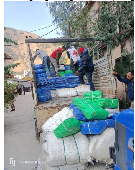
Unloading relief materials in Aathbiskote Municipality, Rukum West