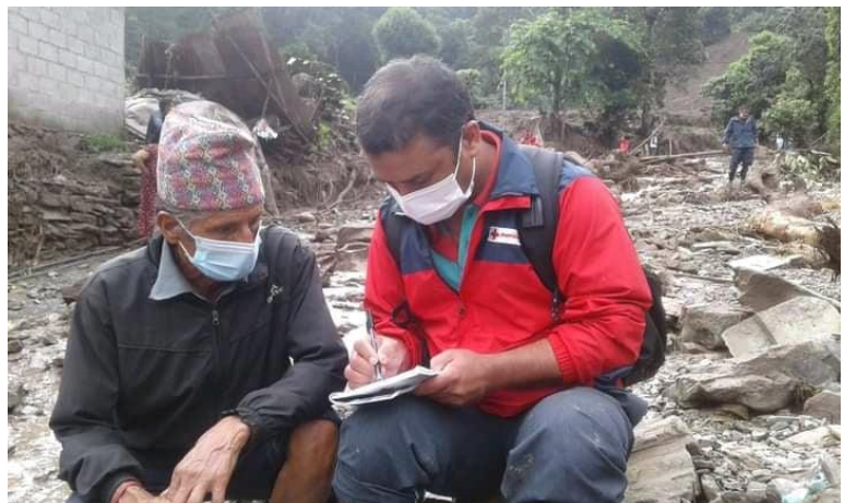
NRCS volunteers conducting initial rapid assessment in Pokhara Metro after the flood destroyed houses.