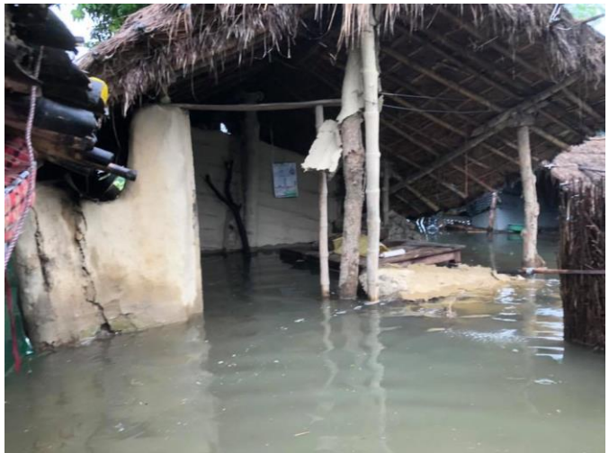
House affected due to recent flooding in Om Satiya Rural municipality, ward no. 1, Rupandehi District

The affected and displaced population are being supported by Nepal Red Cross Society (NRCS) as well as other agencies in those districts. In total, 257 volunteers including Emergency Response Team (ERT) members are being mobilized in affected districts for conducting initial rapid/detail assessment, supporting in search and rescue, constructing temporary shelter, providing psychosocial support services, helping families to evacuate in safe places and for relief distribution.