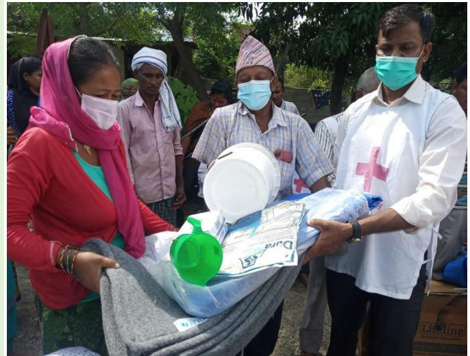
NRCS volunteers distributing relief materials to affected people in Rupandehi.