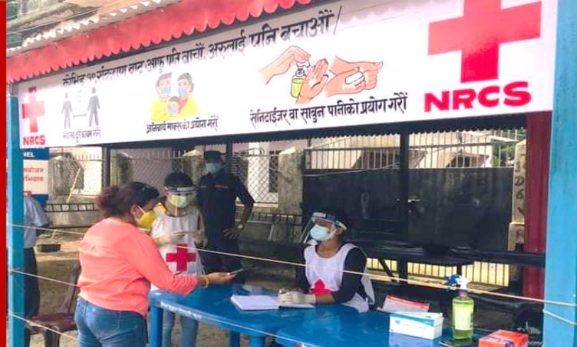
NRCS Jhapa established holding center where volunteers have been providing general health check-up/screening and sanitization services to the migrants passing through Kakarvitta point of entry