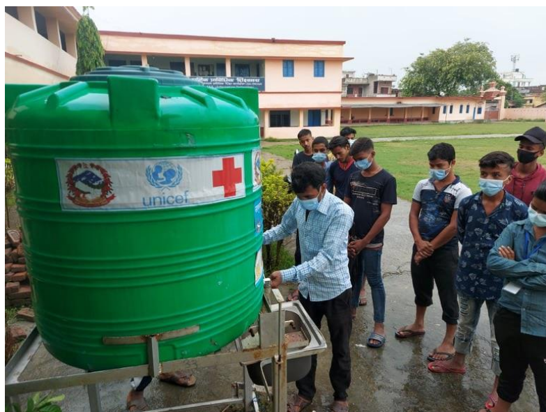
NRCS Rautahat conducted orientation on Repair and maintenance of Contactless Handwashing Station at Juddha Secondary School, Gaur Muniipality