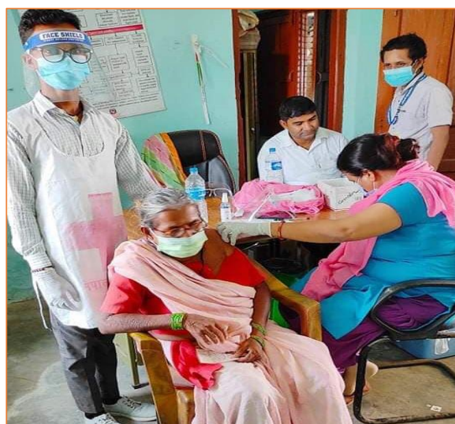
NRCS volunteers supporting in the vaccination campaign

During the orientation, more than 50 queries regarding vaccine were addressed.