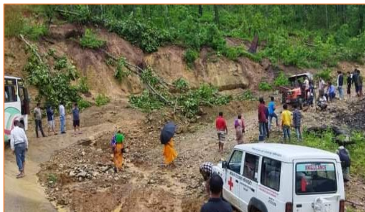
NRCS continued to provide essential ambulance service to the people infected with COVID-19 despite of road blocked due to landslide at various part of the country