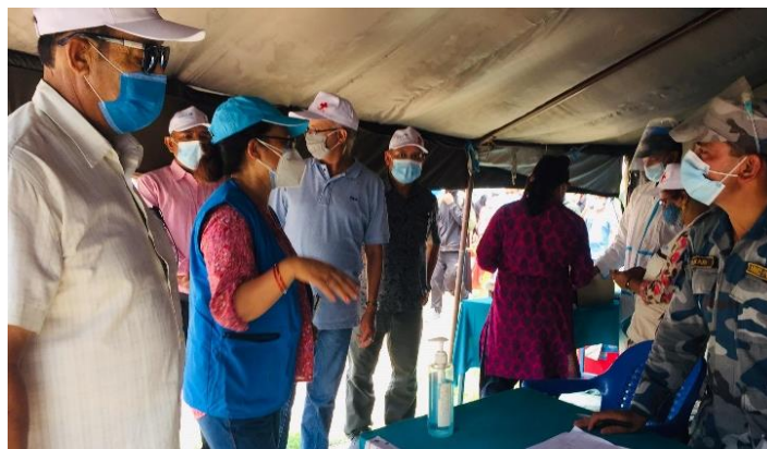
Joint monitoring of COVID-19 response intervention by NRCS HQs and UNICEF team at point of entry and holding centre at Belahiya, Rupandehi

The consolidated reports and info-graphs are available in NRCS website. www.nrcs.org