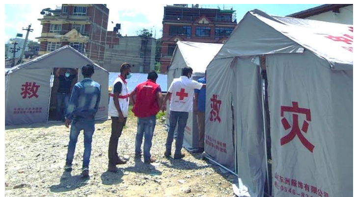
NRCS Bhaktapur district chapter established temporary shelter for visitors of COVID-19 infected patients nearby Korean Hospital at Thimi