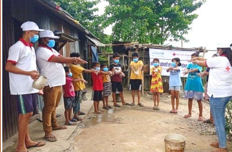
NRCS volunteer conducted proper hand washing demonstration session for children at Kachankawl, Jhapa

NRCS, as an auxiliary to the Government within its capacities and mandates, has been working on COVID-19 preparedness and response operation since early February 2020 in coordination with The MOHP, IFRC, Participating National Societies (PNS), International Committee of the Red Cross (ICRC) and non-Movement partners as well as other stakeholders. NRCS has continued its COVID-19 preparedness and response in 2021 with focus on live saving actions, support for establishment/management of isolation centres, distribution of water bottles and hygiene/dignity kits, and risk communication at point of entry and holding centres, and awareness raising activities such as public service announcement (PSA) through radio and FM stations and miking. Other actions include mobilization of volunteers in COVID-19 vaccination centres/camps and secondment of immunization advisor at MoHP for supporting in overall COVID-19 vaccination campaign in the country. As of 28 June 2021, NRCS has reached 6,102,178 people directly and indirectly through COVID-19 response in Nepal since 1 May 2021.