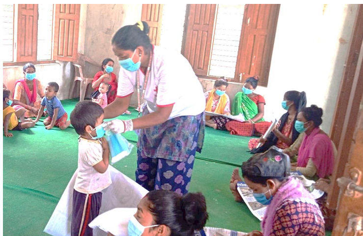
NRCS volunteers distributing mask along with COVID-19 awareness message to women and children through Mothers Group at Gadwa Rural Municipality, Dang