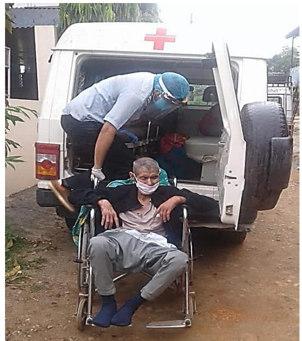
NRCS supported a senior citizen in Khadbari, Sankhuwasabha, to take hospital for further treatment