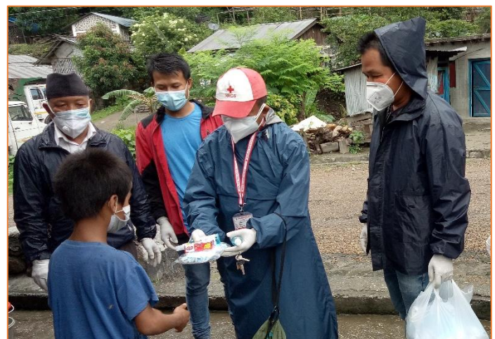
NRCS Kathmandu deployed its volunteer to support in the antigen testing being conducted by local government