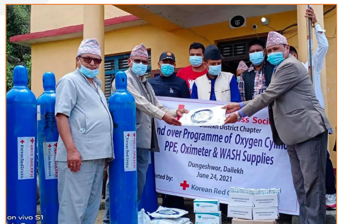
NRCS Dailekh handed over oxygen cylinder, health and WASH supplies to chairman of Dhungeshwor Rural Municipality