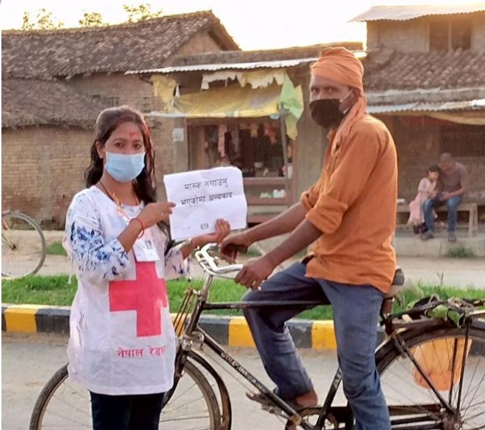
NRCS volunteers have been disseminating COVID-19 awareness message to the walkers at Gulariya Municipality, Bardiya, areas nearby the boarder site