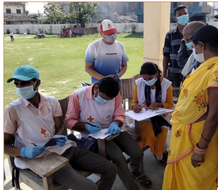
NRCS volunteer supporting for registration people for vaccination at vaccination centre in Malangwa, Sarlahi