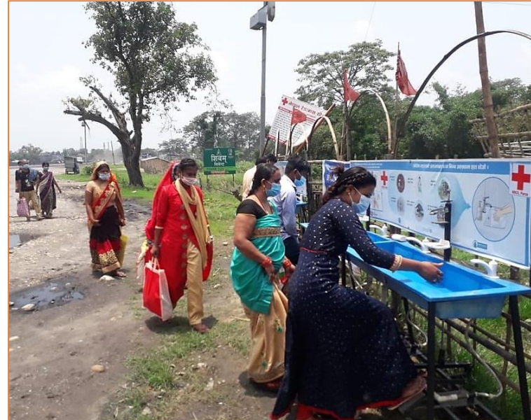
NRCS has established hand washing station at Birjung point of entry