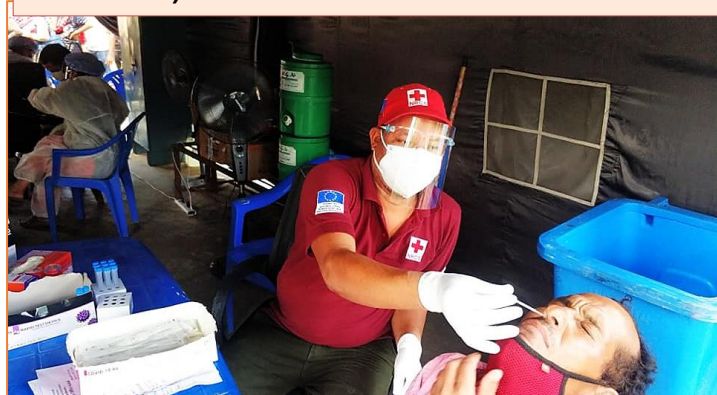
NRCS Kailali district chapter has established COVID-19 PCR test booth at Gauraphanta point of entry for testing the people returning from India