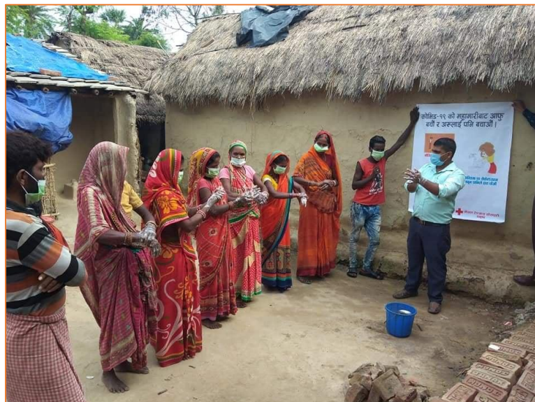
Hand washing demonstration and dissemination of COVID-19 awareness to Tube Well User Committee Members of Dhanusha, Nagarain Municipality