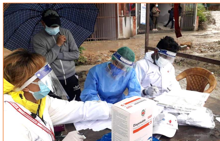
NRCS Kathmandu deployed its volunteer to support in the antigen testing being conducted by local government