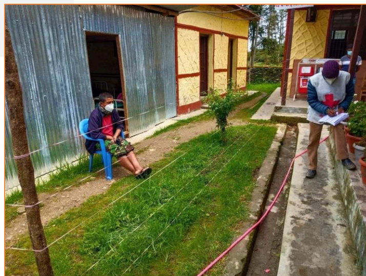
NRCS volunteer involving in contact tracing surveillance at Ainselukharka Rural Municipality Ward No.3, Khotang