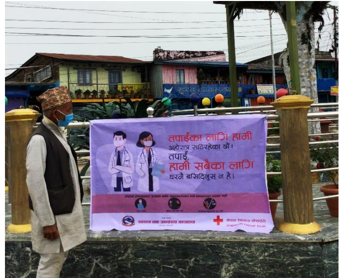
A senior citizen, reading COVID-19 awareness message displayed at Mude Bazar, Dharmadevi Municipality Ward No. 3 in Sankhuwasabha