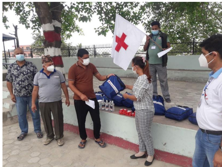
NRCS Makwanpur district chapter distributed hygiene kit to the persons infected with COVID-19 in Hetauda -6, Gauritar, Makwanpur