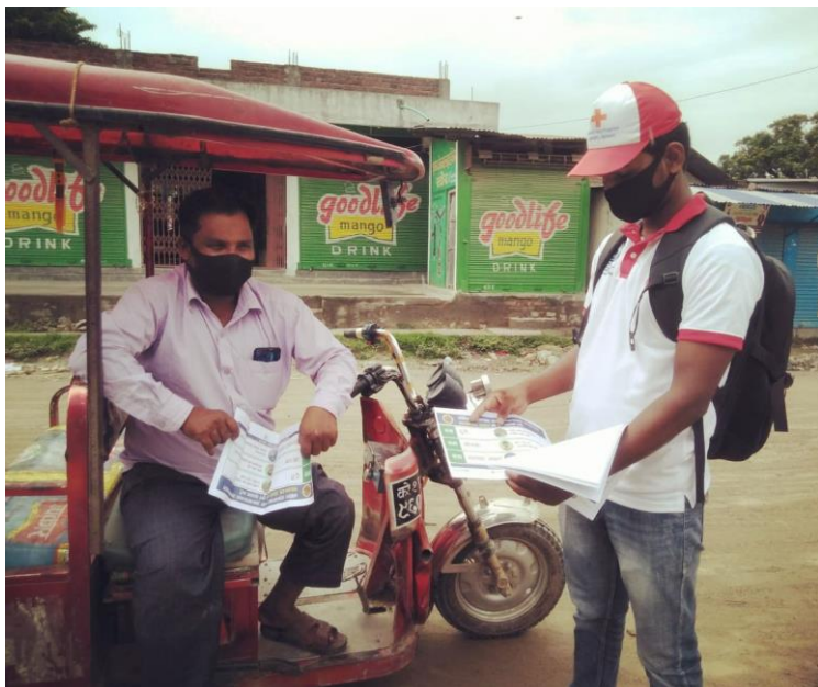
Unit action team member of Sunsari district sharing information on importance of proper use of mask and hand washing