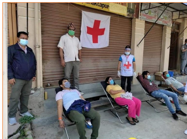
People participating in door to door blood collection campaign conducted by NRCS Bhaktapur district chapter to meet blood demand during this pandemic