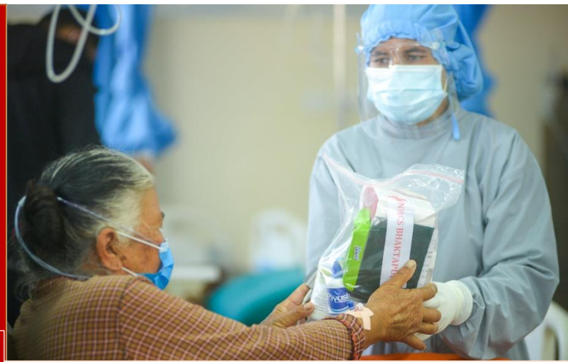
NRCS distributed hygiene kit to the person infected with COVID-19 hospitalized at Bhaktapur Hospital

As of 31 May 2021, NRCS has reached more than 1,500,000 people directly and indirectly through COVID-19 response in Nepal since 1 May 2021.