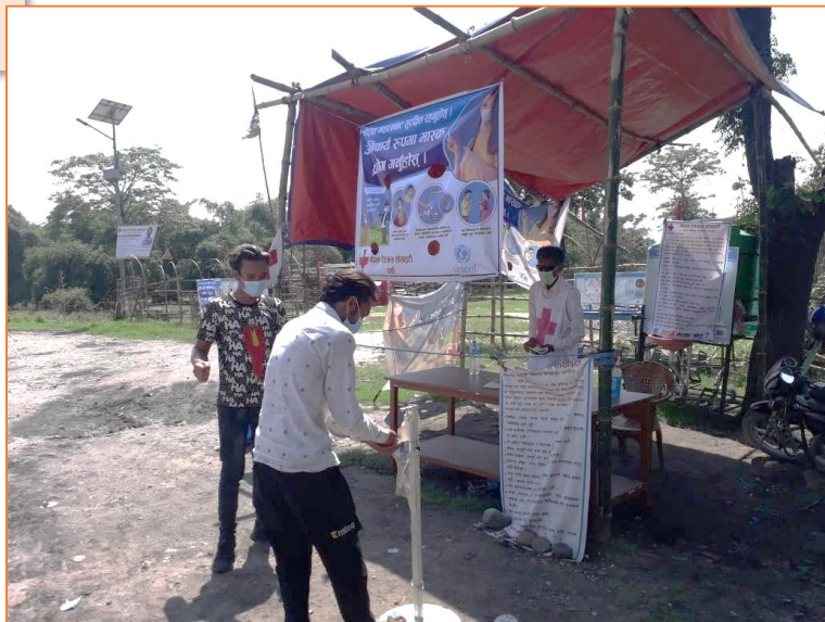
A returnee from India at Birjung Point of Entry, using the hand sanitizer set up installed by NRCS. The National Society has been providing COVID-19 awareness message through help desks at various points of entry