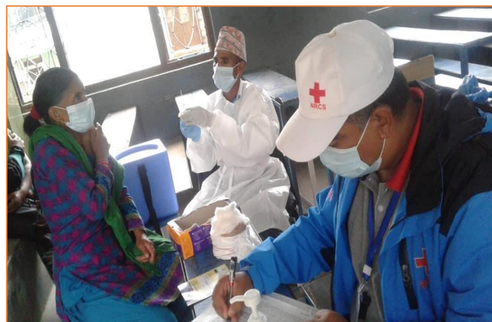
NRCS volunteer mobilized in COVID-19 vaccination camp at Bajrabarahi Secondary School, Godawari Municipality, Lalitpur during the registration of people for COVID-19 vaccination