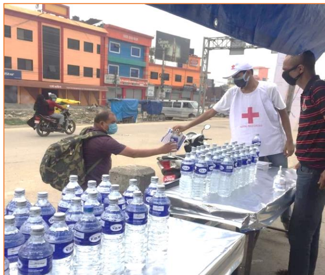
NRCS volunteer distributing drinking water to the people entering Nepal at Behaliya point of entry