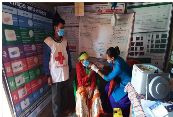
NRCS volunteer supporting at various vaccination clinic/center