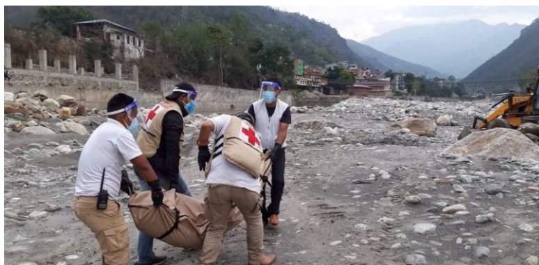
NRCS staff and volunteer during dignified dead body management of COVID-19 infected patient