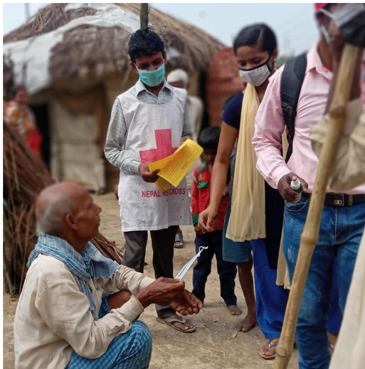
Unit action team member of Parsa sharing information on importance of proper use of mask, and hand washing