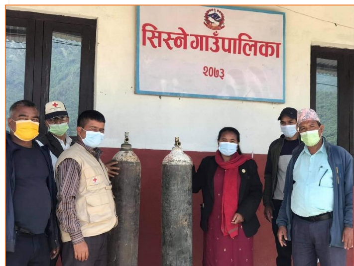
NRCS Rukum Purba district chapter handed over 2 oxygen cylinder (each 50 liter capacity) to Sisne Municipality of the Rukum Purba district