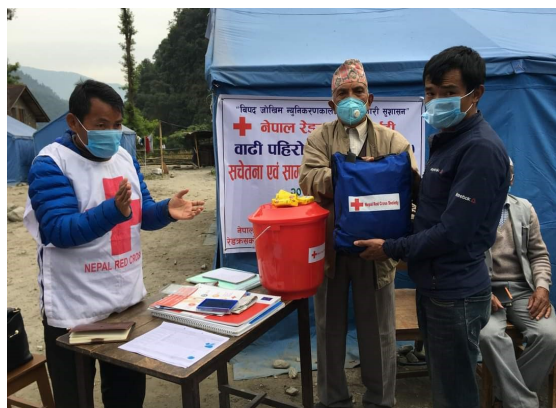
Distribution of hygiene kit to the affected

Multiple communities have been affected by landslides in various districts during this monsoon. 106 households of Budhabare, Sili-chong rural municipality in Sankhuwasabha district was not an exception.