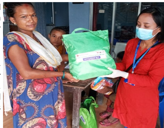
Distribution of hygiene kit

People always remember NRCS support in these difficult time as clear as their saying " Ahat ko bela rahat " that means they breathe the air of relief by this help of Nepal Red Cross Society (NRCS). They never back-down to thank NRCS for understanding their difficult situation and helping them when in need.