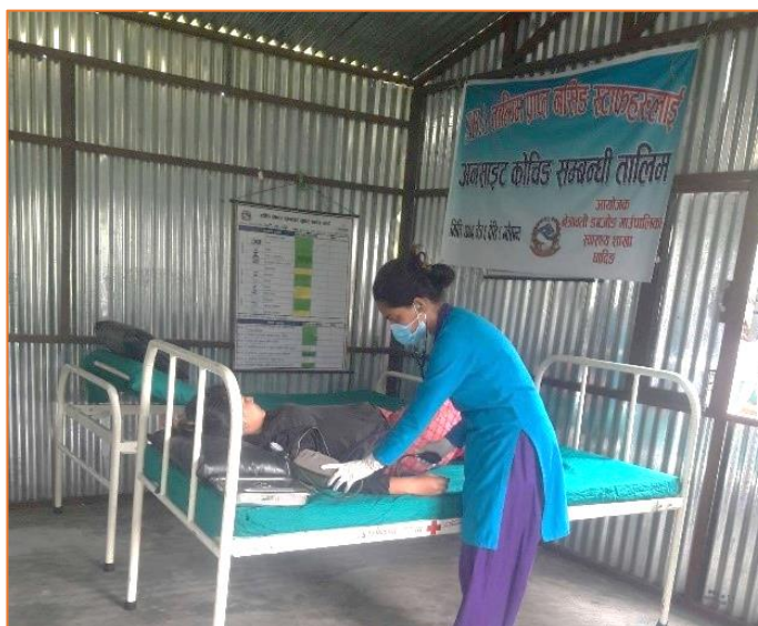
NRCS Dhading supported with bed to Semjong Health Post