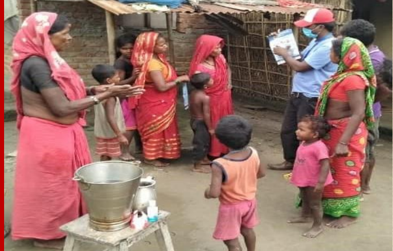
Community people of Bhokara municipality receiving information on COVID-19 and hand washing session shared by NRCS volunteer

Nepal Red Cross Society (NRCS) has been involved in COVID-19 preparedness and response since early February 2020 in coordination with the Ministry of Health (MOHP), and Health Emergency Operation Centre (HEOC). NRCS provincial and district chapters are engaged in various activities: food distribution, quarantine management, ambulance services, awareness raising activities, tents/tarpaulins and non-food relief items (NFRI), restoring family links, psychosocial first aid, health/help desk, personal protective equipment (PPE), sanitizers, hygiene kits, soaps and information educational and communication (IEC) materials. The NRCS frontline workers are also ensured with the safety and security along with insurance provision. Along with COVID-19, NRCS is also involved in monsoon preparedness and response activities.