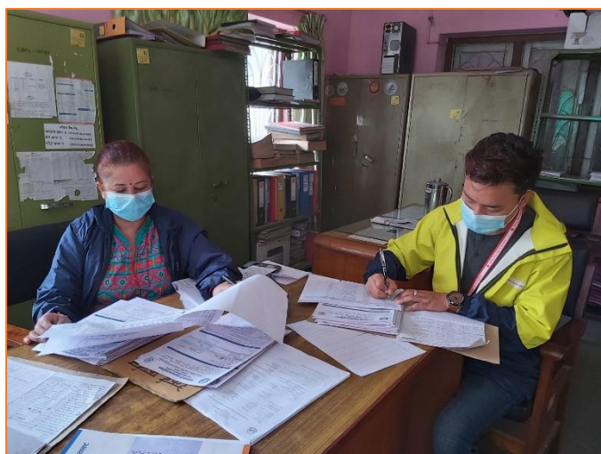
NRCS volunteer supporting in COVID-19 Case Investigation and Contact Tracing (ICT) task in Ward No.12, Kathmandu Metropolitan City