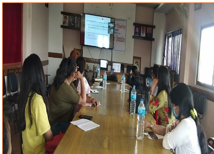
NRCS Kathmandu conducted Volunteer participating in the Protection Gender and Inclusion (PGI) orientation conducted by Kathmandu district chapter