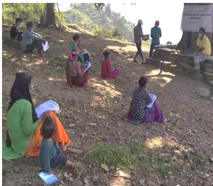
NRCS Baitadi conducted awareness raising session to the community people on COVID-19