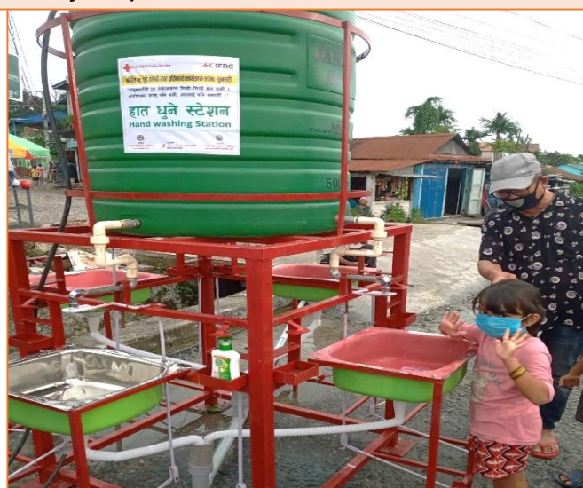
A small girl washing her hand in a 4 basin contactless hand washing station placed at Relwechowk-17, Dharan