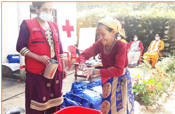
A woman from Bheri Municipality practicing the hand washing steps during hygiene kit distribution program