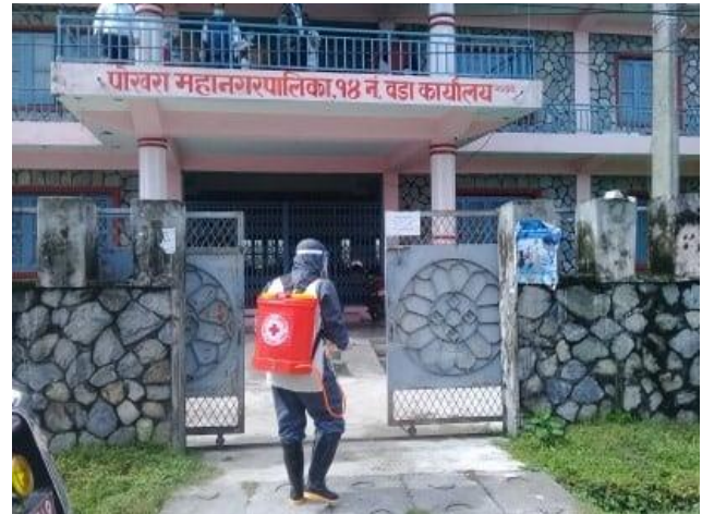
NRCS volunteer involved in disinfection of public areas in Pokhara Metropolitan City