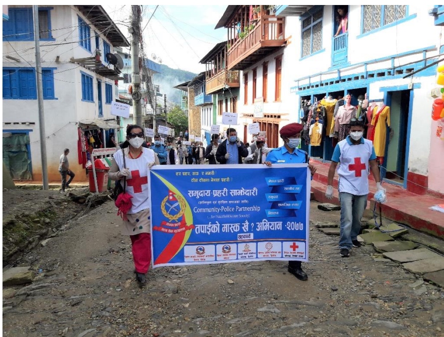
“Where is your mask?” awareness campaign conducted by NRCS Khotang together with local stakeholders to sensitize community on importance of using mask

With joint effort of District Administration Office, District Police Office, Diktel Rupakot Majuwagadhi Municipality and Chamber of Commerce and Industry, NRCS Khotang district chapter launched "Where is your mask campaign?" to reduce the risk of COVID-19 through dissemination of public awareness message. In Diktel, the district headquarters of Khotang. The campaign was started from 5 August 2020.