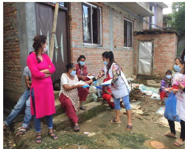
NRCS volunteer providing information on COVID-19 through door to door visit along with mask distribution