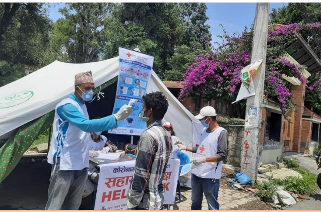
NRCS volunteer providing information on COVID-19 through help desk set up at various points along with temperature check-up of community people