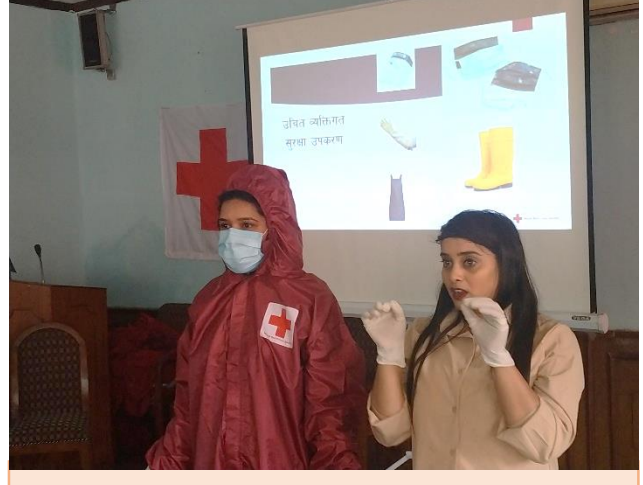
Briefing on proper use of personnel protective equipment to NRCS staff during IPC training.