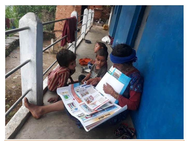
Social mobilizer preparing for disseminating COVID-19 and, floods and landslides awareness message through community meetings and household visit in Baitadi district