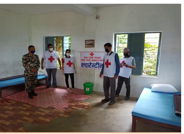
NRCS in coordination with Nepal Army supported in management and set-up of 20 bed-quarantine along with some food items, in Saraswati School, Diktel