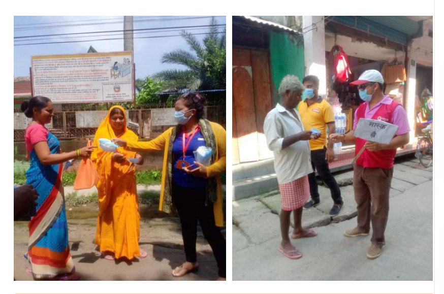
NRCS volunteers sensitizing community members on importance of using mask along with mask distribution in Saptari district