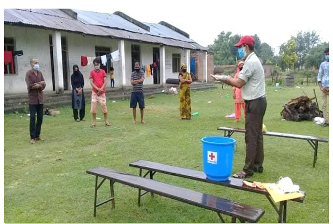
NRCS volunteer conducting handwashing demonstration sessions in the quarantines center of Dang