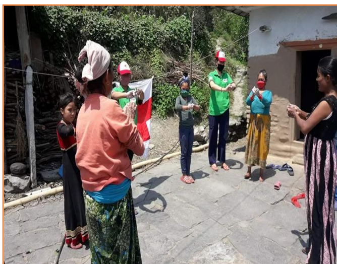
NRCS staff and volunteers involved in door to door hand washing campaign in Myagdi district