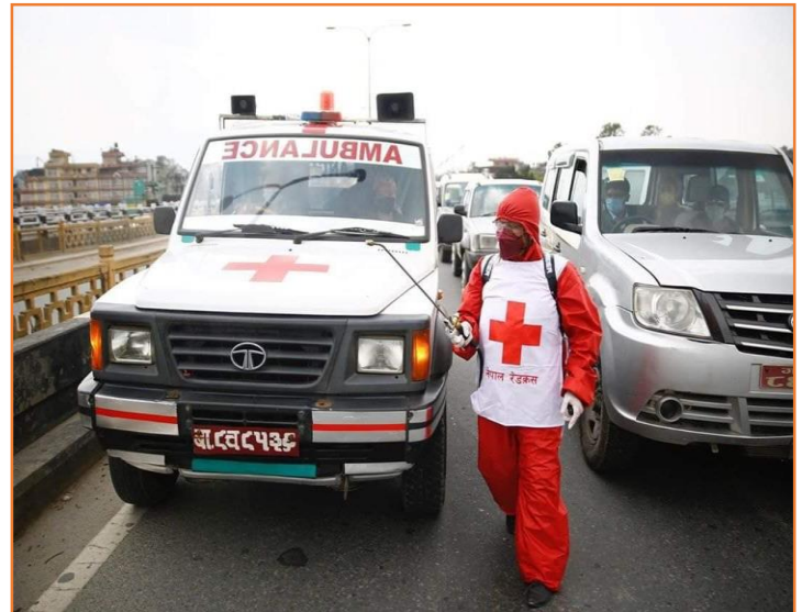
NRCS volunteer disinfecting the vehicles in Madhyapur thimi Bhaktapur.