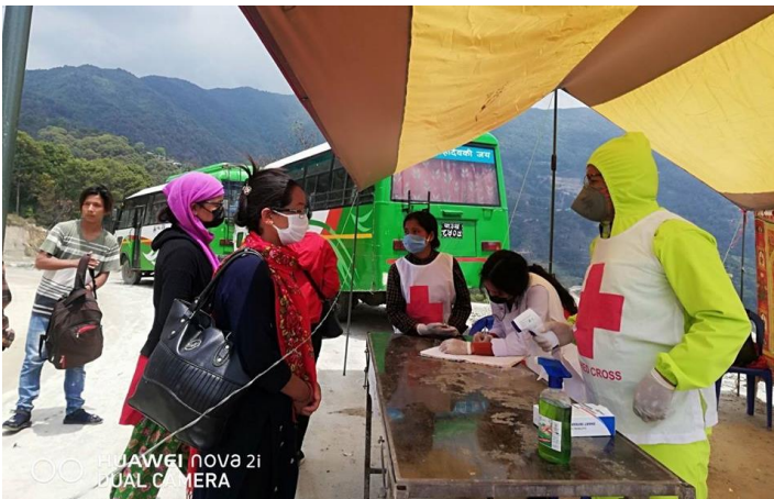
NRCS volunteers/staff sharing information about COVID-19 and providing temperature taking services to the people passing through Nuwakot Highway from Kathmandu.