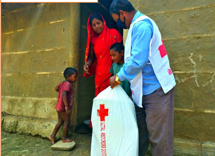
Red Cross at door step

NRCS Biruwaguthi sub-chapter president handed over the NFRI package to family affected by wind/storm during COVID-19 lock down period in Parsa.