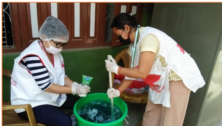
Preparation of local sanitizers by NRCS Kathmandu district chapter volunteers at Tarakeshwor Municipality.