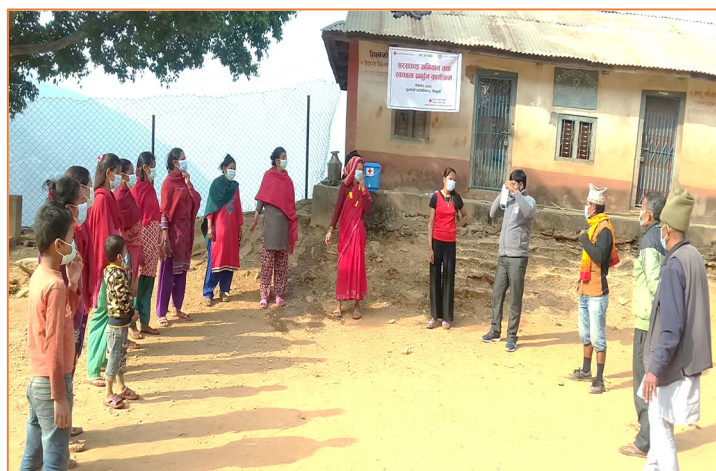
NRCS volunteer sharing information on IPC measures to the community people in Sunkoshi Rural municipality -6