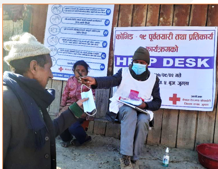
Information dissemination and mask distribution to the community people by NRCS volunteer in Jumla