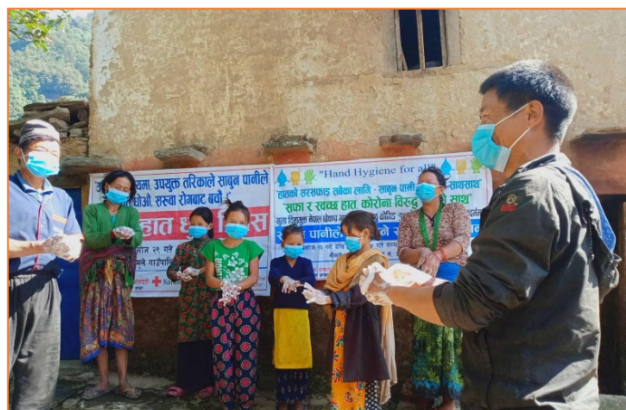
Community people of Dailekh learning and enjoying the hand washing session through practical demonstration