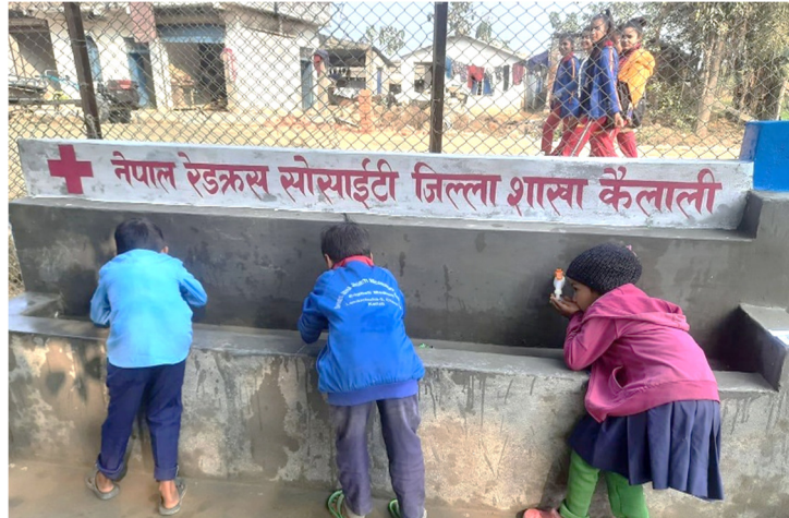
Students washing their hands at the newly constructed hand washing station