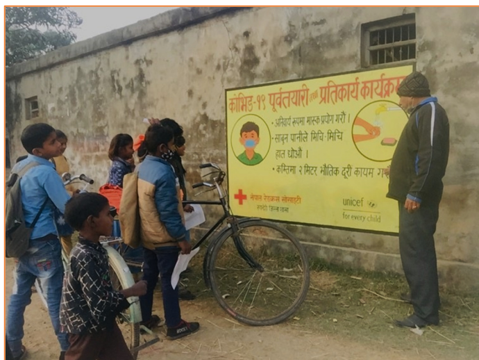
Students seeing the roadside awareness message on COVID-19