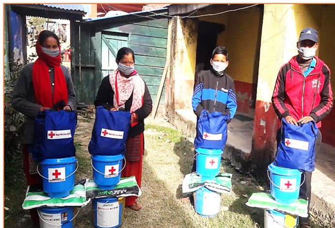
NRCS Bajura distributed hygiene kit and dignity kit to community people