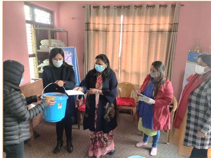
NRCS distributed Cash and dignity kit to LGBTIQ community people