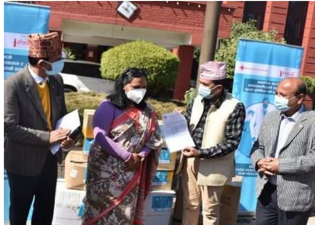
NRCS and Coca Cola handover safety gears to enhance the safety of frontline health workers and ICU ventilators to the Health Minister