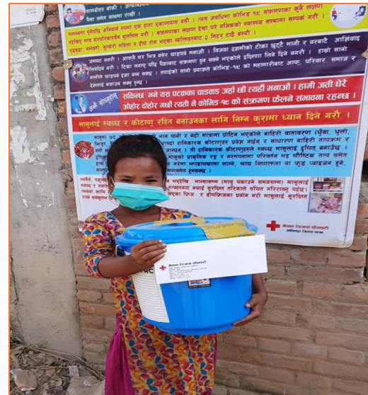
A child being happy after receiving the support from Red Cross. NRCS have distributed cash support to identified vulnerable children and dignity kit to their parents at various areas