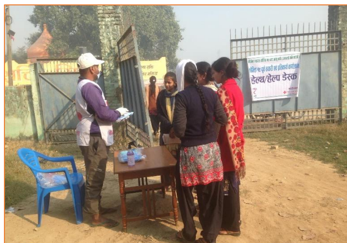
NRCS volunteer providing information on COVID-19 and provided mask to visitors at the Help desk