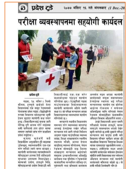
News coverage of NRCS intervention in local newspaper