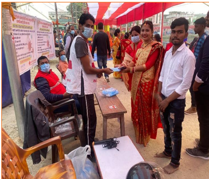
NRCS volunteer distributed mask to the people during Chhat celebration along with the awareness message through its help desk at various celebration point