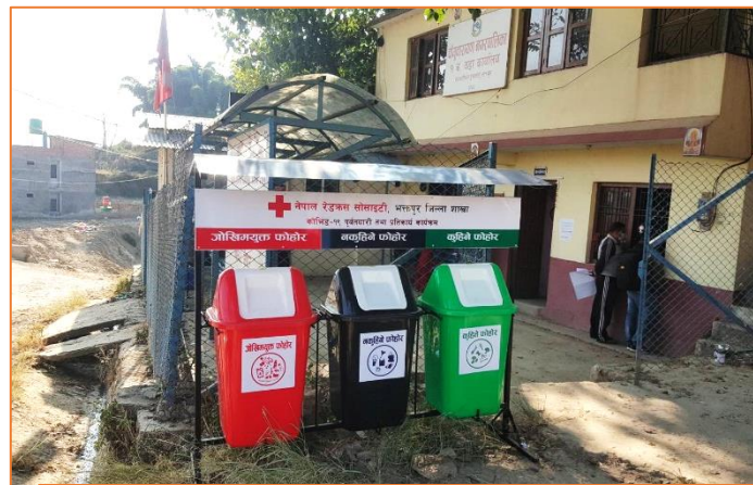
NRCS installed dust bin at the premises of Ward No. 1, Changunarayan Municipality