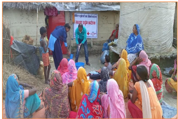
Hand washing practice for community people in Sisiyadi Bairiya Community in Parsa