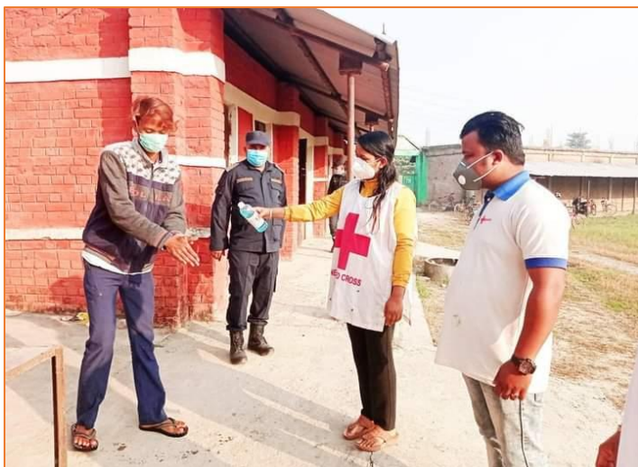
A student sanitizes prior to attending the examination. NRCS volunteer conducted awareness session on COVID-19 in order to ensure that student attending class 12 examination follows safety and protective measure against COVID-19