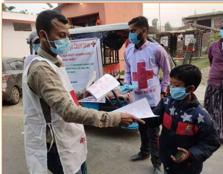
NRCS volunteer distributing COVID-19 awareness related IEC material to the community people of Dhanusha