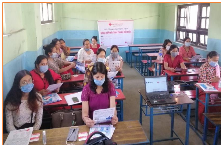
People from Ward No. 17, Lalitpur Sub Metropolitan City attending orientation session on Social and Gender based violence