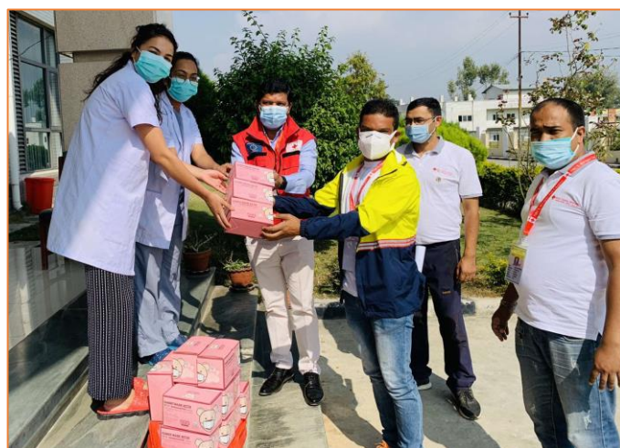
NRCs volunteers provided mask to isolation center at Kirtipur