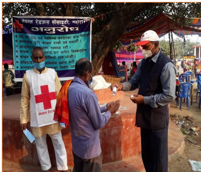
NRCS volunteer distributed mask to the community following precaution measures