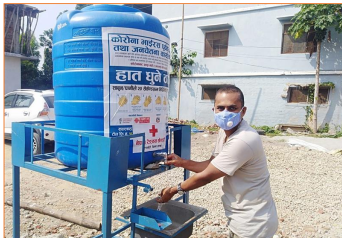
A person for community washing hand at hand washing station installed by NRCS