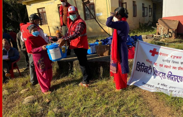
Distribution of dignity kit by NRCS Dhading in Tripurasundari Rural Municipality, Ward No. 2, Dhading

Update # 12 Issue date: 27 November 2020