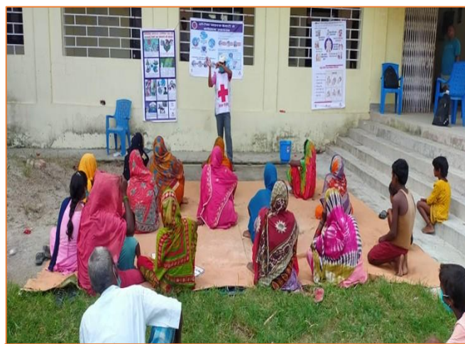
Orientation on the Infection Prevention and Control measures to the community