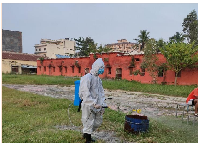
NRCS frontline volunteer disinfecting Trijudda Secondary School in Parsa district