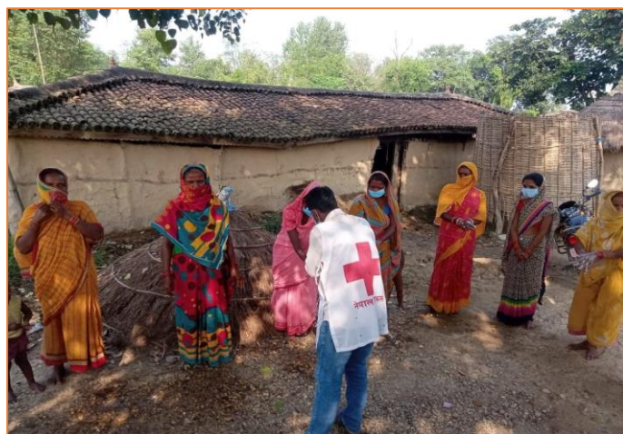
Women of Pokhariya Municipality, Ward no. 4, Parsa attending hygiene promotion and hand washing demonstration session