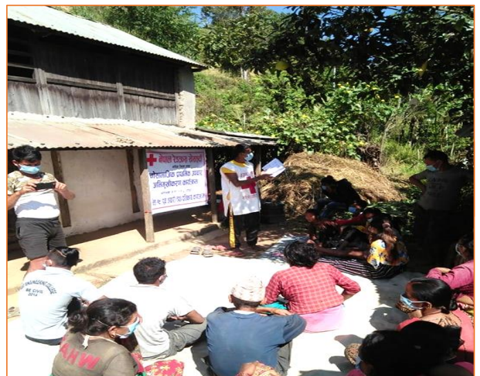
NRCS volunteer providing orientation session on Psychosocial First Aid to the community people of Jwalamukhi Rural Municipality, Dhading