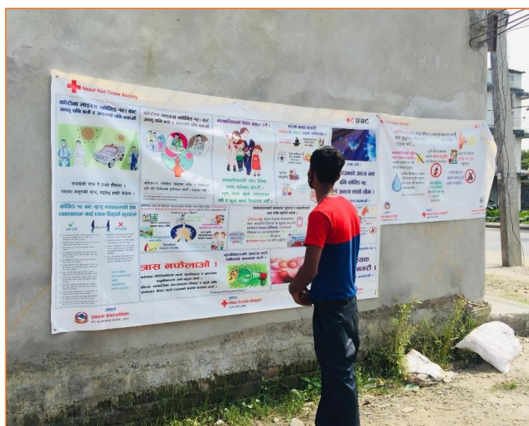
A passer going through information on COVID-19 displayed at a wall of public place in Ward No. 1, Inaruwa Municipality