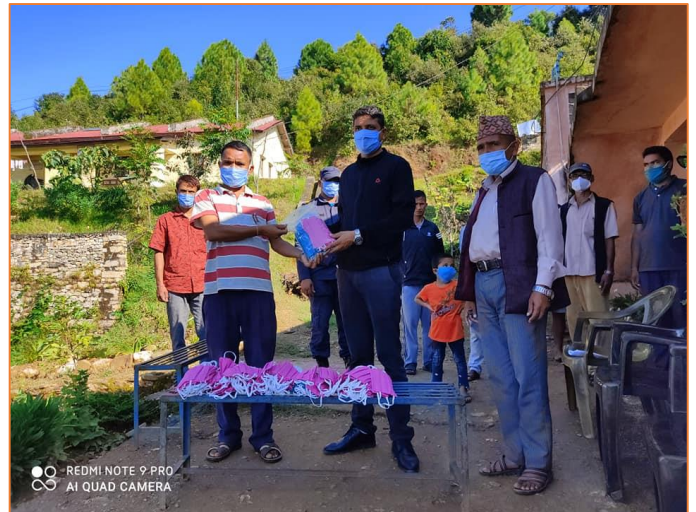
Distribution of the locally produced mask to the District Jail Office, Achham