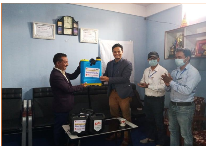
NRCS handed over a hand spray machine and Hypochlorite solution to Dharan Sub Metropolitan City, Ward No.17