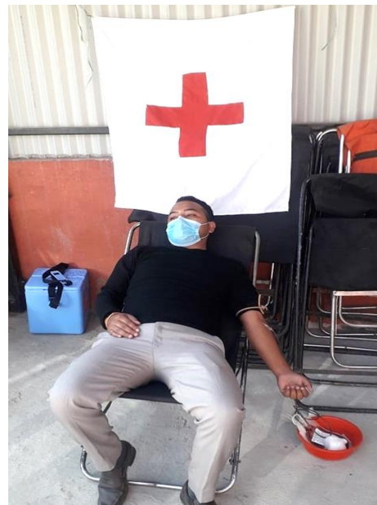
A beneficiary of COVID-19 Preparedness and Response Operation, donating blood for plasma therapy