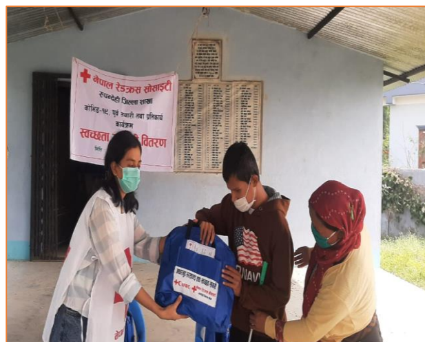
NRCS reaching the most vulnerable people with its support during COVID-19 response