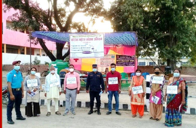
The "Hajurko mask khoi?" ("Where is your mask?") Campaign has stirred up considerable interest in the Gadhwara Rural Municipality in Dang

The Nepal Red Cross Society (NRCS), within its capacities and mandates to respond as auxiliary to the Government in the prevention and alleviation of human suffering, has an important role to play in controlling this outbreak. The National Society has been disseminating information about safety behaviours, facilitating community on infection prevention and control measures, and help to prevent misinformation, rumours panic and stigmatisation. It is also imperative that the National Society takes steps to protect its own staff and volunteers from exposure in the line of duty. As a leading volunteer-based humanitarian actor in the country, the NRCS has been playing a unique role in reaching communities. NRCS is leading the localized COVID-19 preparedness and response operation in coordination with Government of Nepal, IFRC, Participating National Societies (PNS), ICRC and other stakeholders. In addition, NRCS is supporting the Government in coordination with other organizations such as UNICEF, Nepal Army, etc. to manage the holding centres (a temporary set up established by the Government for the people entering to Nepal before taking them to quarantine sites or home quarantine).