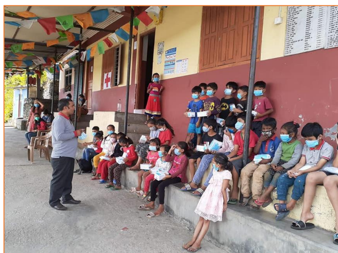
NRCS volunteer describing proper use of mask to children from vulnerable household at Pokhara-18, Lamagaun