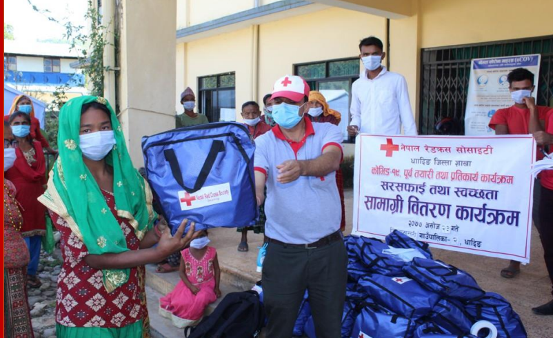
People from community in Tripurasundari Rural Municipality, Ward No. 6, Dhading district receiving hygiene kit supported by NRCS Dhading