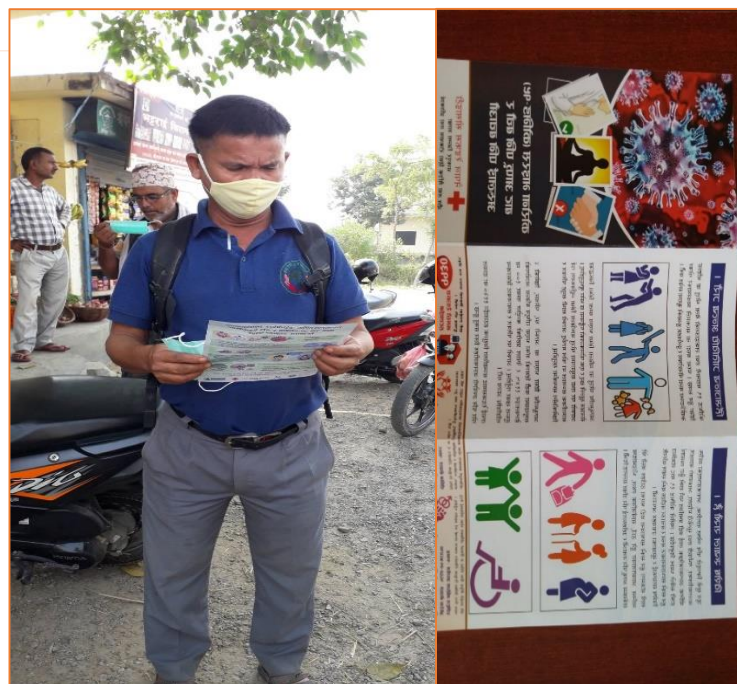
A man in Rupandehi district reading the pamphlet with information on SGBV components distributed by NRCS volunteer