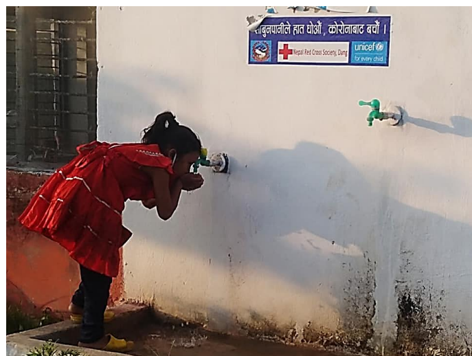
A girl using child friendly tap constructed by NRCS and UNICEF in Bidhyanagar quarantine site, Dang