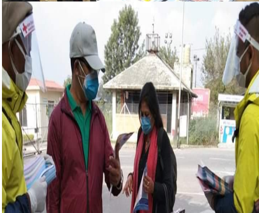
NRCS Kathmandu and Bhaktapur have been disseminating COVID-19 awareness message to travellers at point of entry, airport and bus parks (Photo: NRCS Kathmandu and Bhaktapur)