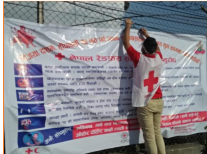
Flex with Dashain wishes along with COVID-19 awareness message kept at various points of entry and bus park targeting the people travelling