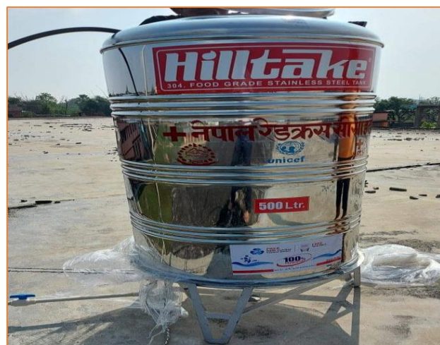
Water filter installed in quarantine site at Judhha Ma.Vi, Gaur-2, Rautahat