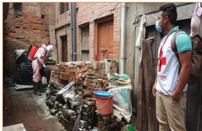
Disinfecting the community where there are reported confirmed cases of COVID-19