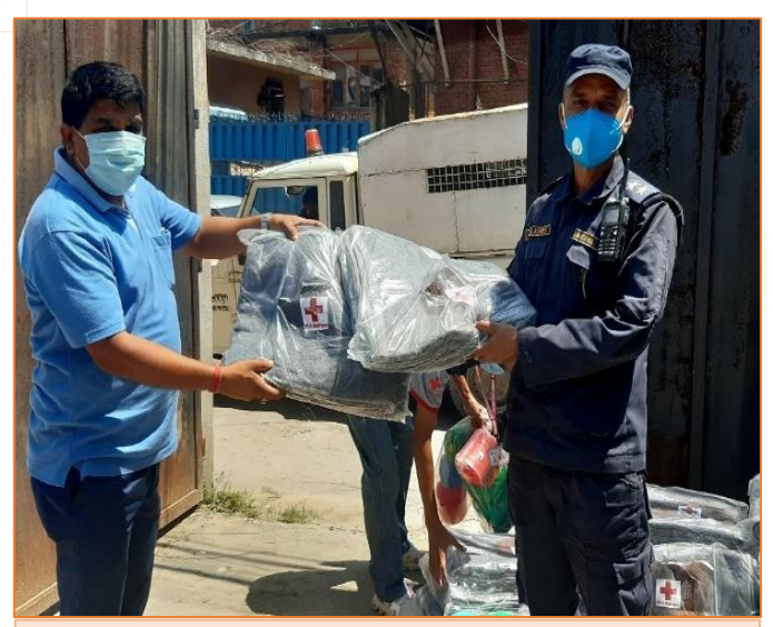
NRCS Bhaktapur supported blankets, buckets, mugs, mattress and rope to Metropolitan Police, Thimi for constructing 20 bed isolation center in Sanothimi Bhaktapur