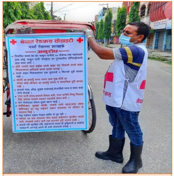
NRCS Parsa district has printed flex in local language and displayed at key public places such as medical shops and other places and public vehicles to promote awareness against the COVID-19 infection