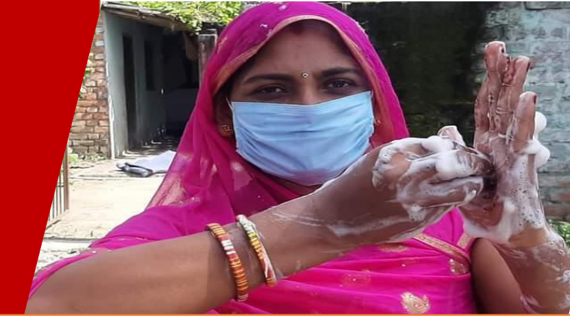
Nepal Red Cross Society has supporting women and young girls with dignity kits, hygiene materials and awareness on proper hand washing

Update # 7 Issue date: 11 September 2020