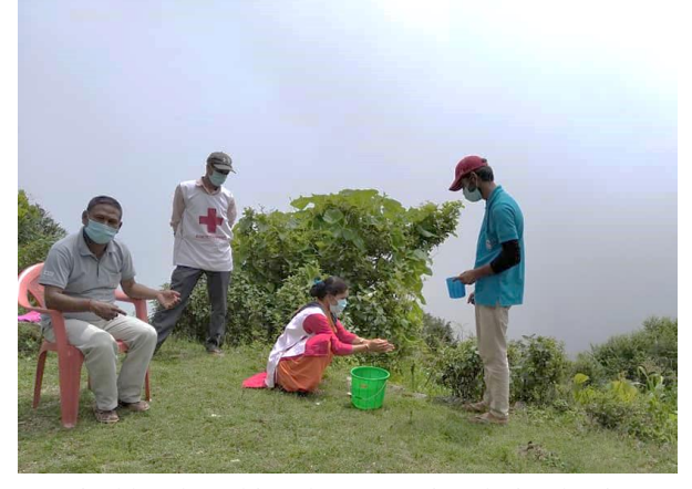
Practical hand washing demonstration during hygiene promotion orientation