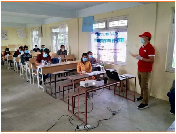
WASH aawareness session organized to NRCS staff/volunteers on who have been mobilized in the community