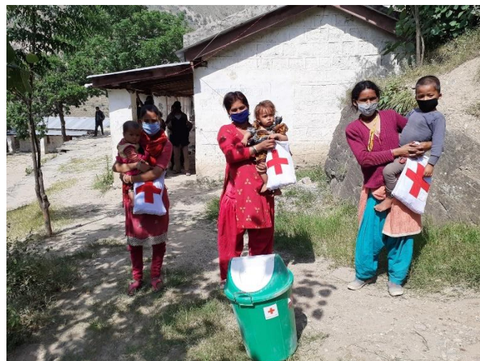
Distribution of dignity kits to women residing in quarantine site of Kalikot, after the awareness raising session on COVID-19 and WASH, which was held in support of Community Empowerment for Health Promotion Program