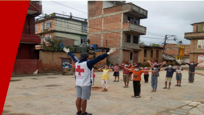
Children attending the practical session of PSS session conducted by NRCS Thaiba subchapter, Lalitpur