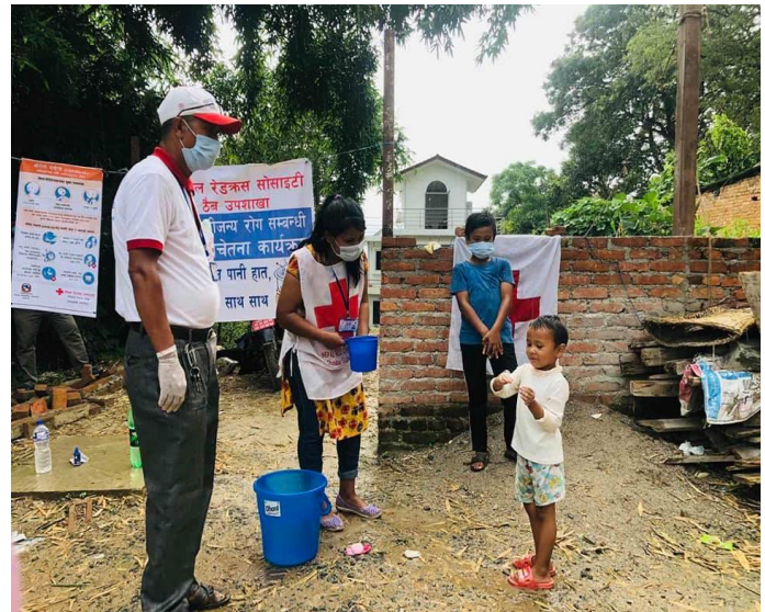
Children attending hand washing demonstration session conducted in Lalitpur