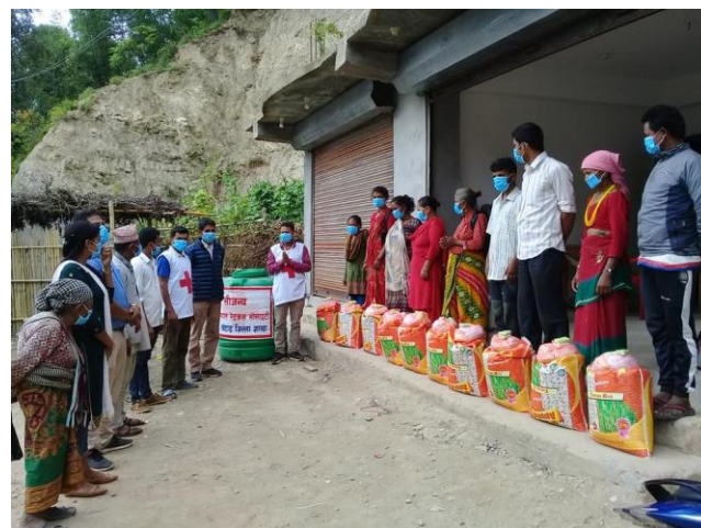
Food distribution to the affected families in Khotang district