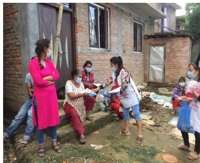
NRCS volunteer providing information on COVID-19 through door to door visit along with mask distribution