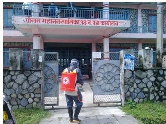
NRCS volunteer involved in disinfection of public areas in Pokhara Metropolitan City