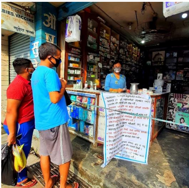
NRCS Parsa has flex in local language and displayed in key public places such as medical shops and other places to promote awareness against the COVID-19 infection