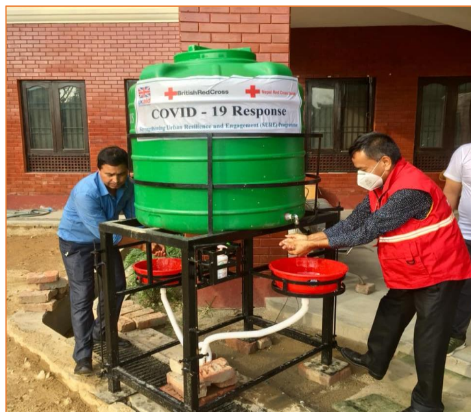
Contactless hand washing station established at Budhanilkantha, Kathmandu