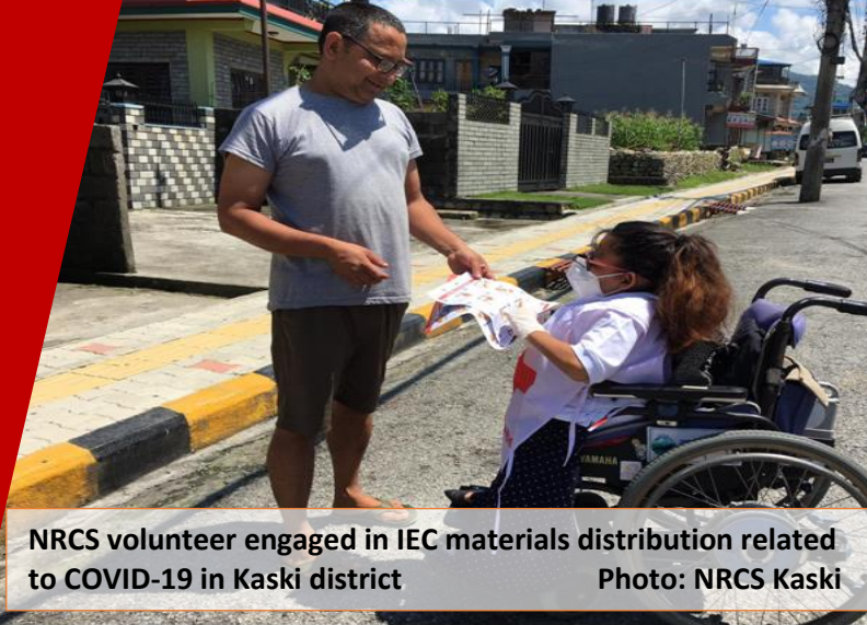
NRCS volunteer engaged in IEC materials distribution related to COVID-19 in Kaski district