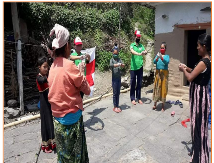
NRCS staff and volunteers involved in door to door hand washing campaign in Myagdi district