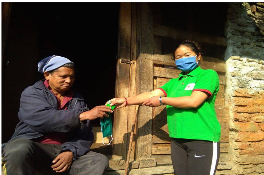
Figure : Mask distribution by Red Cross volunteer in Myagdi district