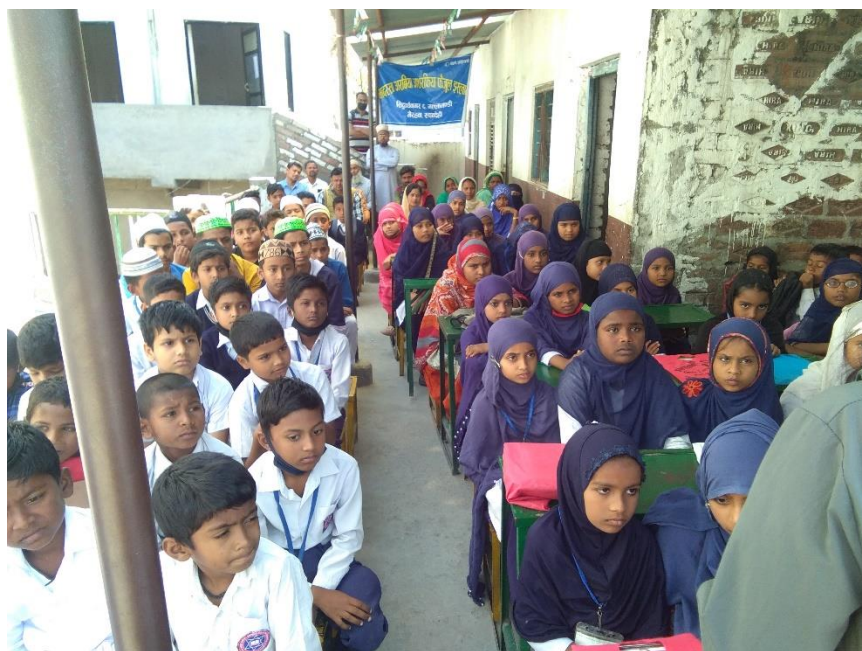
Figure : COVID-19 Awareness in Rupandehi