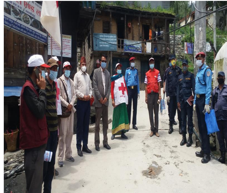
On 31st July, Mugu Red Cross distributed 150 Mask and 300 Covid related posters in Gamgadhi Bazaar .