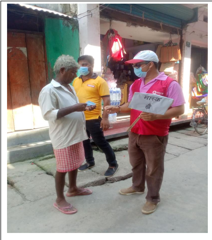
Figure :Nepal Red Cross Soceity volunteer from Saptari district raising the awarness on proper use of mask.