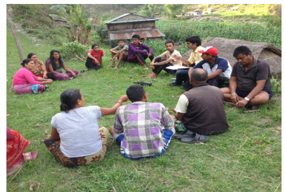
Water resources mapping training, Gorkha

11,647* people reached with livelihoods activities